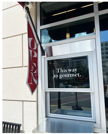
Featured: Vinyl Decals were placed along storefront windows