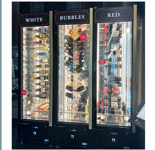
Featured: Custom Vinyl Clings for Wine Refrigerator and Food Coolers