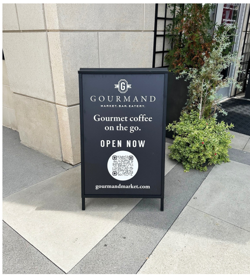
Featured: A-Frame Boards using Custom Vinyl Decals on Metal Inserts